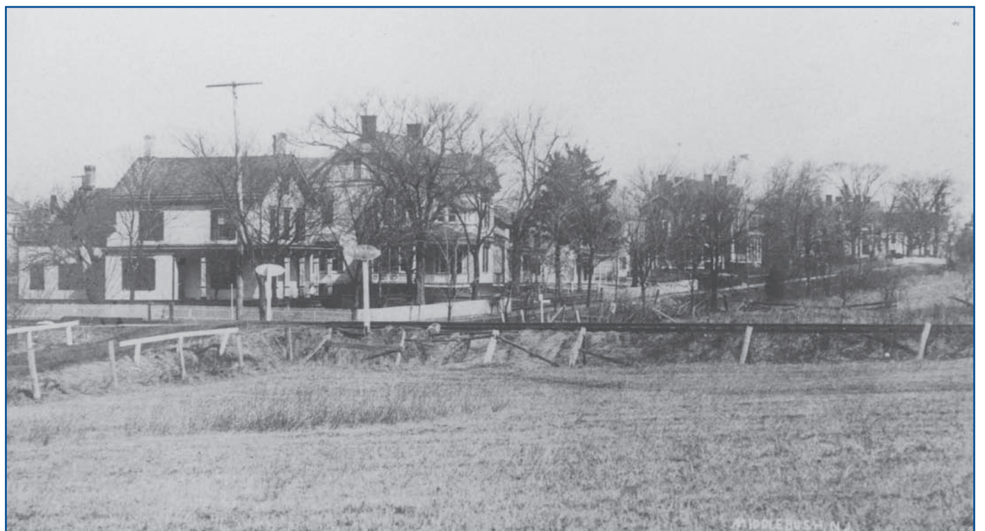
Railroad Crossing at South Middlebush Road, looking north, (c.1908)