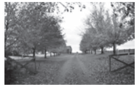
Van Liew Suydam Historic House

is proud to present the 2014 Trails Calendar showcasing photos from the Township, the submissions and winning images of the Trails Photography Contest.