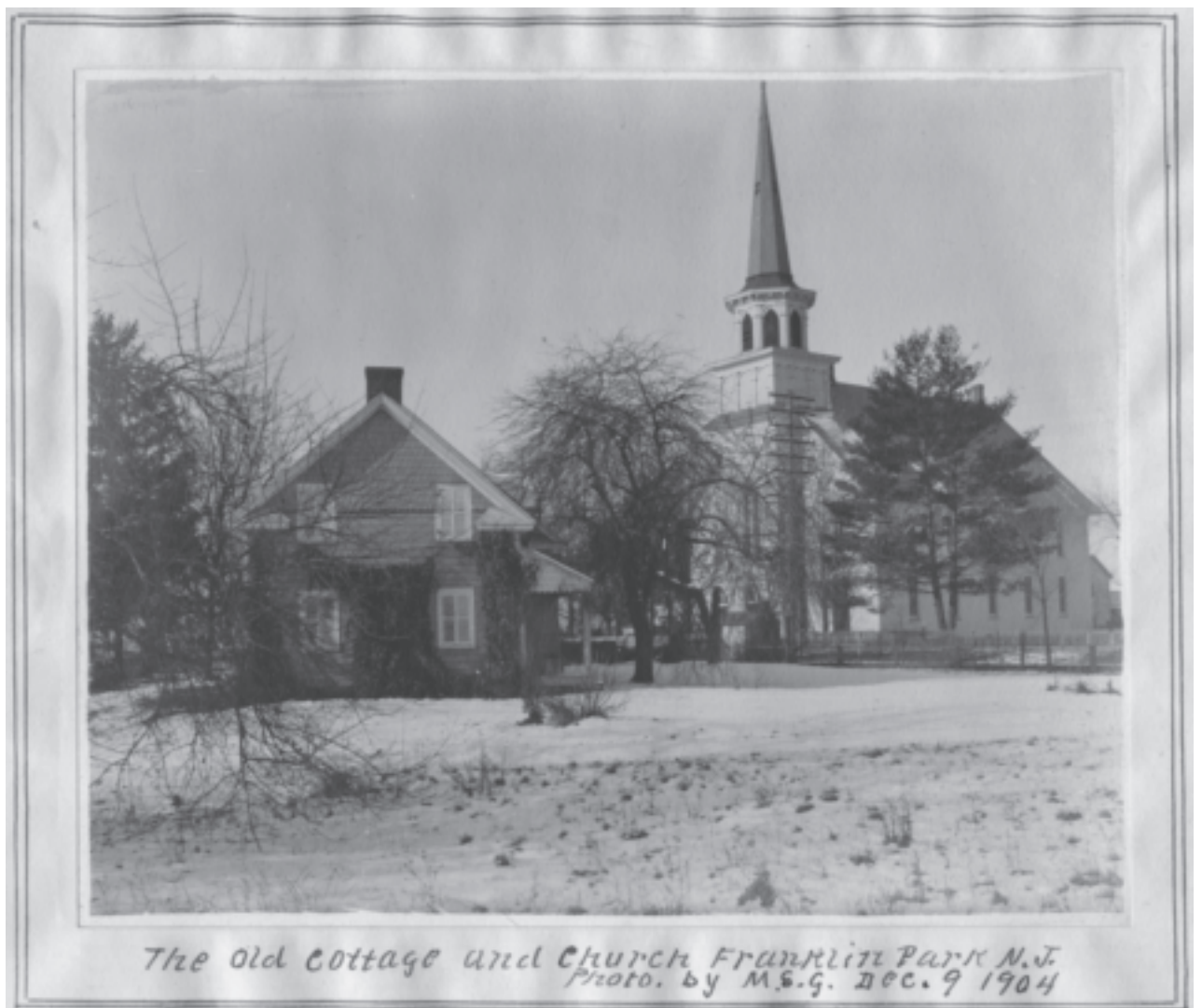
The old cottage and Church Franklin Park N.J. Dec. 9 1904

Central Jersey Housing Resource Center (CJHRC) is a HUD certified non-profit housing counseling agency located in Raritan. Franklin has contracted with CJHRC to provide one-on-one counseling and group programs. They will assist in finding senior, low and moderate-income housing options either to rent or buy. Grants are available to assist with down payments and closing costs. Applicants looking for affordable rental or purchase units must apply and be certified based on income and household size. For information, call 908-704-9649 or visit www.cjhrc.org .