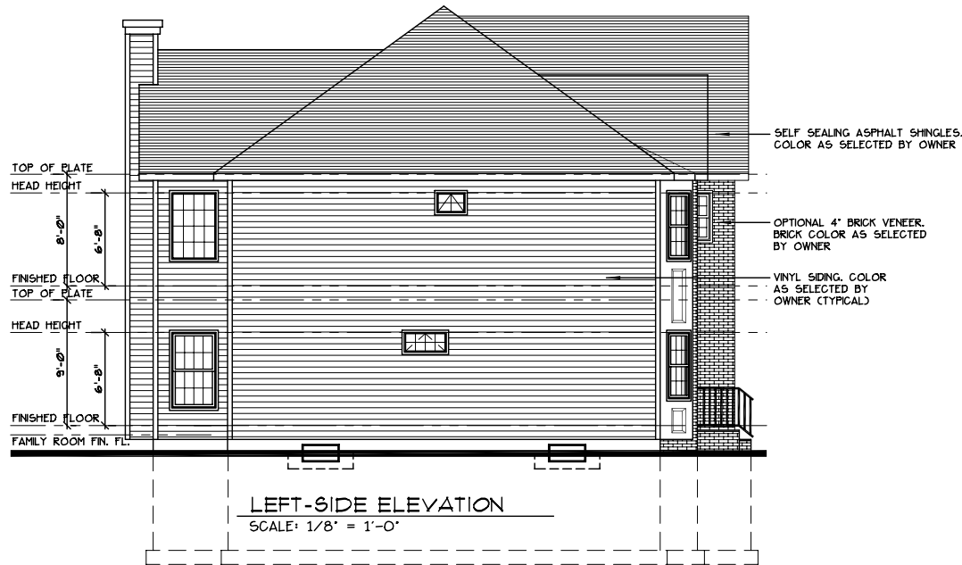
LEFT-SIDE ELEVATION SCALE: 1/8" = 1'-0"

FOR PLANNING BOARD OR BOARD OF ADJUSTMENT ONLY. NOT TO BE USED FOR CONSTRUCTION PERMIT.