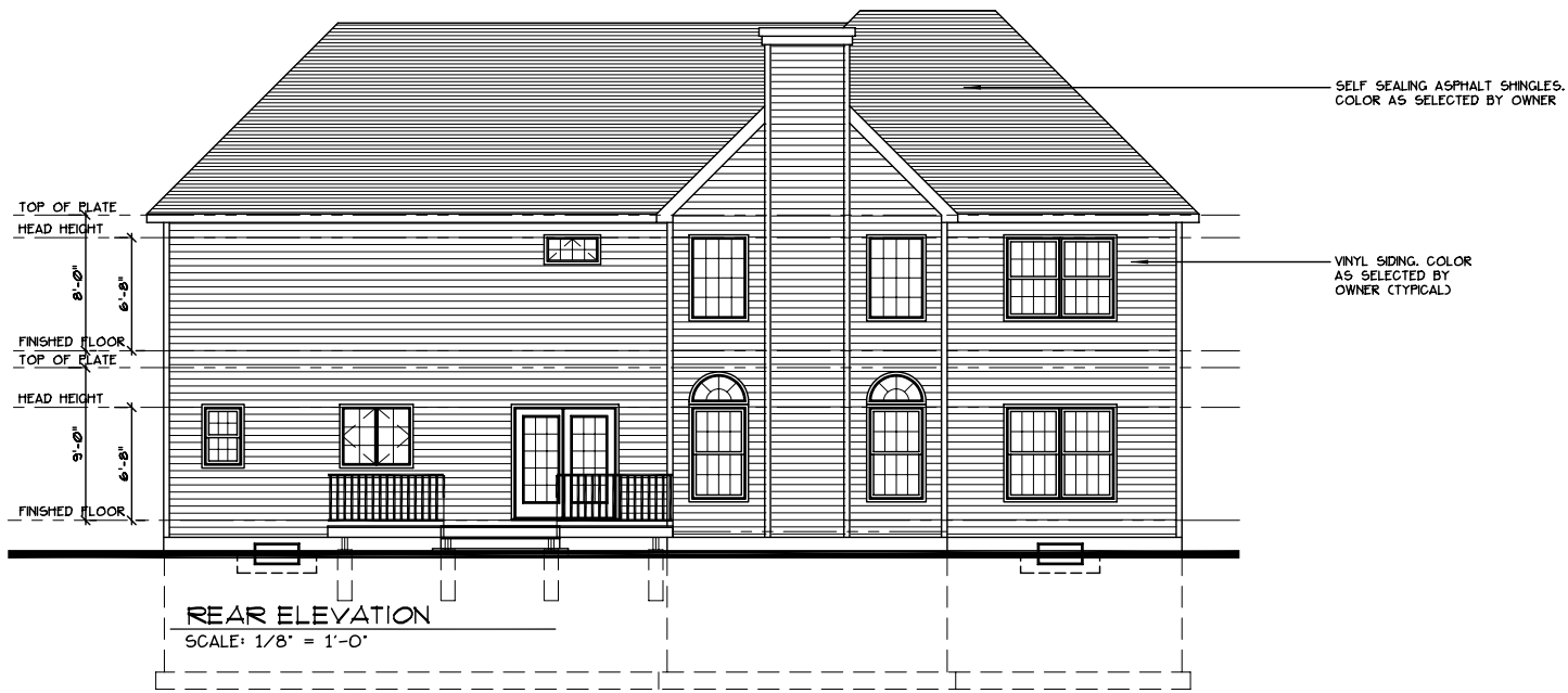
REAR ELEVATION SCALE: 1/8" = 1'-0"