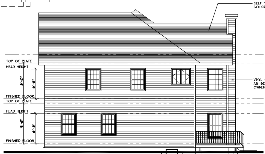
FRONT ELEVATION SCALE: 1/8" = 1'-0"

SELF SEALING ASPHALT SHINGLES. COLOR AS SELECTED BY OWNER