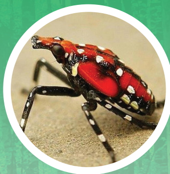
Late nymph July-Sept.