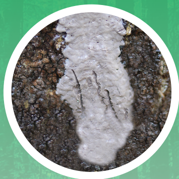
Egg mass Sept.-June

Search for all spotted lanternfly life stages