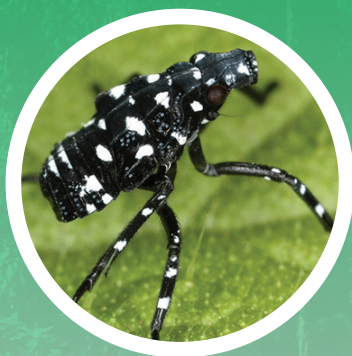
Early nymph April-July