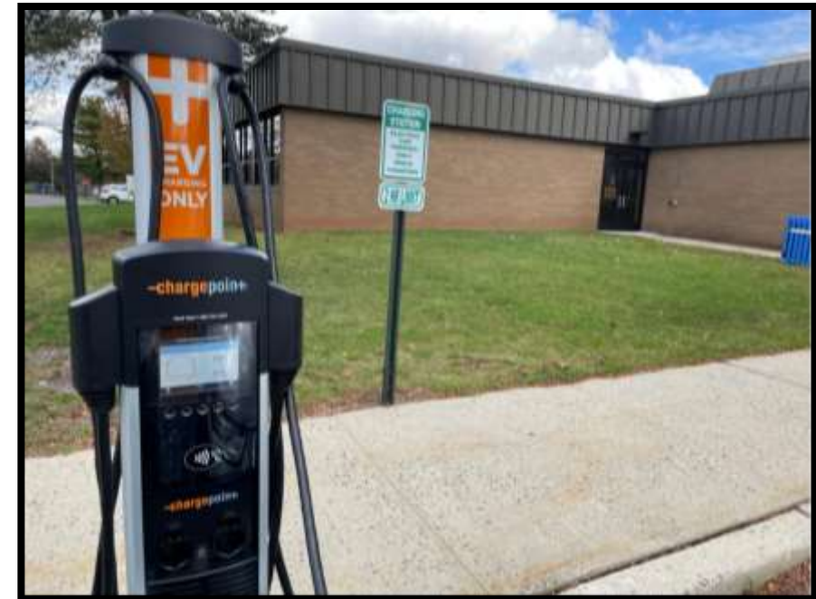
EV Charging Station at Municipal Building