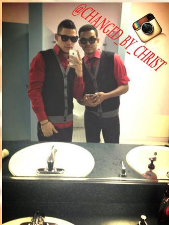
Changed By Christ